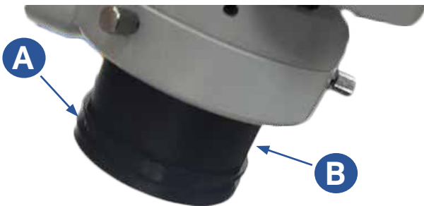
Figure 2. Screw the Adaptor Ring (A) onto the bottom of the microscope (B).