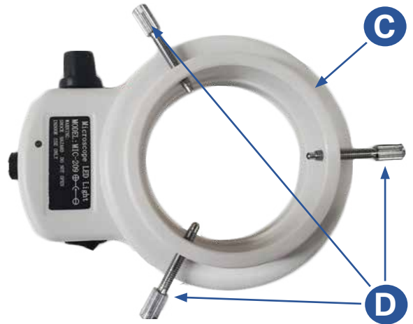
Figure 3. The Light Ring (C) will slide up over a lip found on the Adaptor Ring (A). First, loosen all three screws (D).