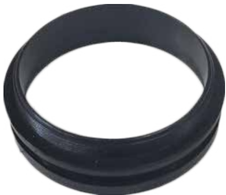
Figure 1. The Adaptor Ring screws onto the bottom of the microscope, providing a base to which the light ring will attach.

The following instructions replace those found in the user's guide on page 15 with the header "LED lights."